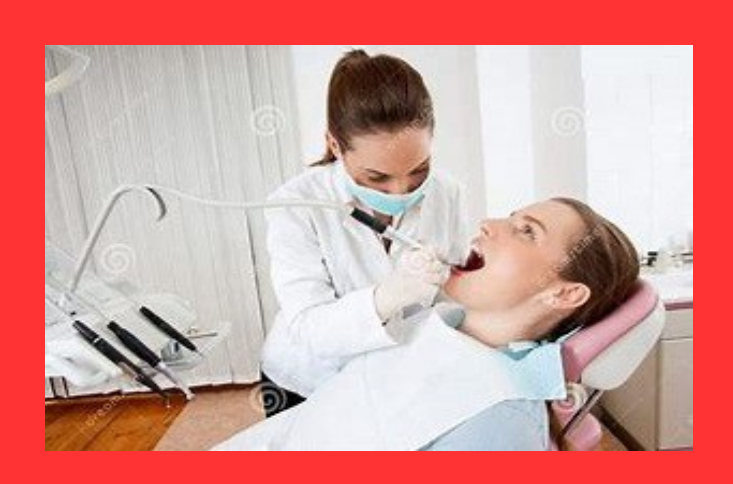
LOOKS GOOD TO ME!